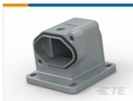
TE Part # T1946031000-009 H3APR-MAGS-EMC-C