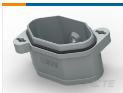
TE Part # T1937031000-009 H3APR-MAGSW-EMC-C